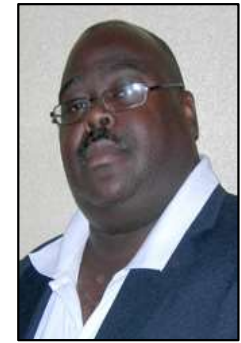
Youth Director 6